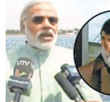
Handed over to Indian agencies immediately, He also labelled him as a 'very violent and evil man, who must face justice in India.

Donald Trump's declaration to extradite Tahawwur Rana, a key accused of 2011 Mumbai terror attacks, has found the law has been widely welcomed and is also seen as United States standing behind the country in its fight against acts of terror, mostly emanating from Pakistan.